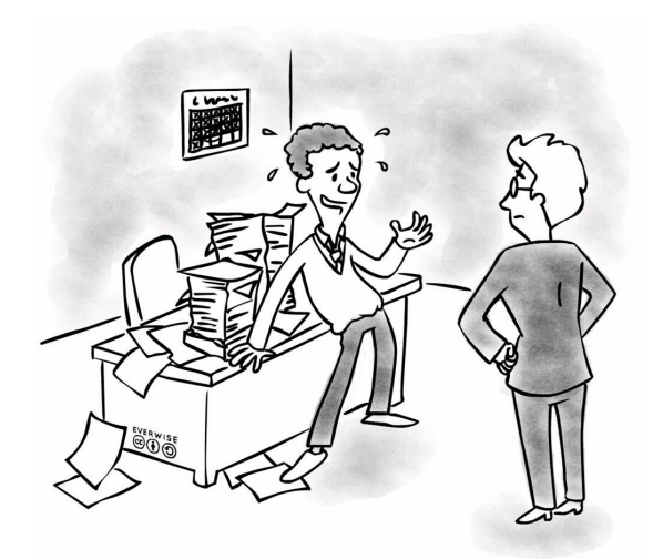
"Thanks for asking. Everything's going great!"