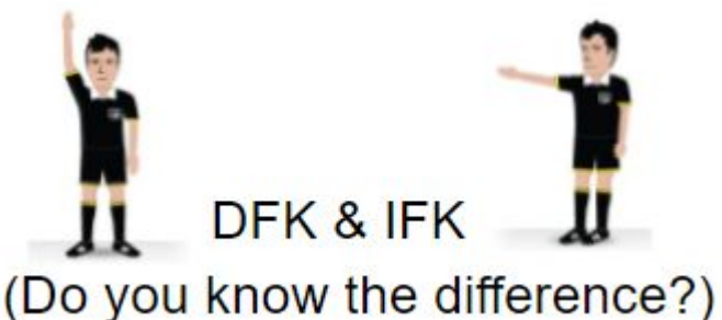
DFK & IFK